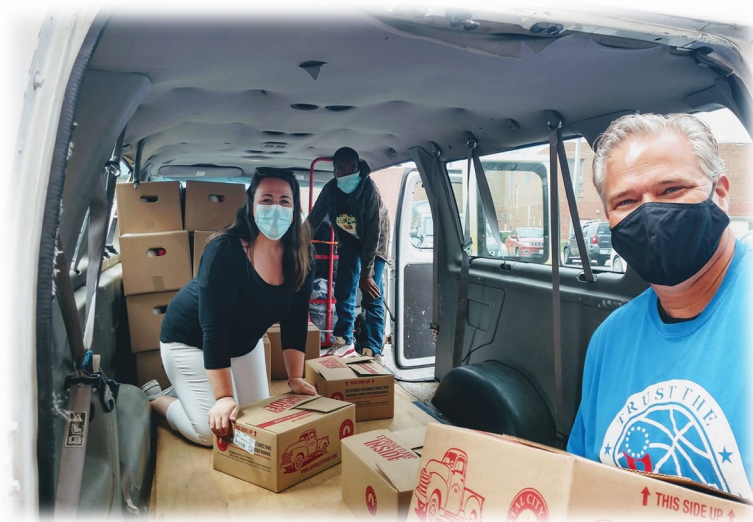
Food delivery to families during the pandemic